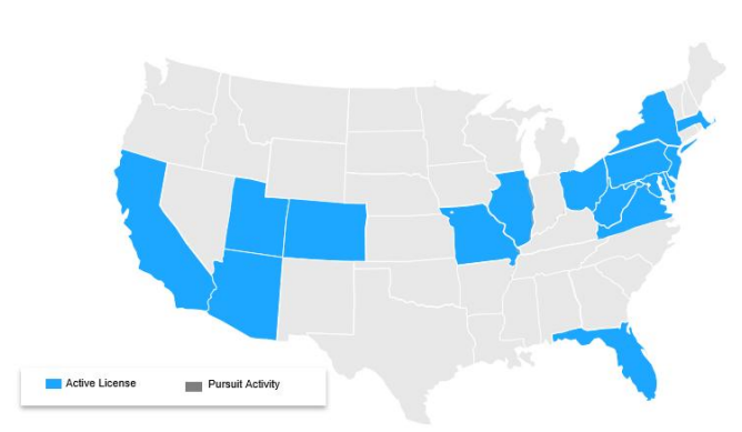
Figure 1: Columbia Care Footprint

Columbia Care is one of the largest and most experienced cultivators, manufacturers and providers of cannabis products and services in the United States.