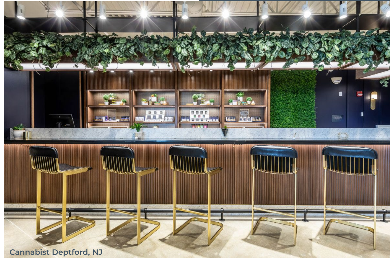
Cannabist Deptford, NJ