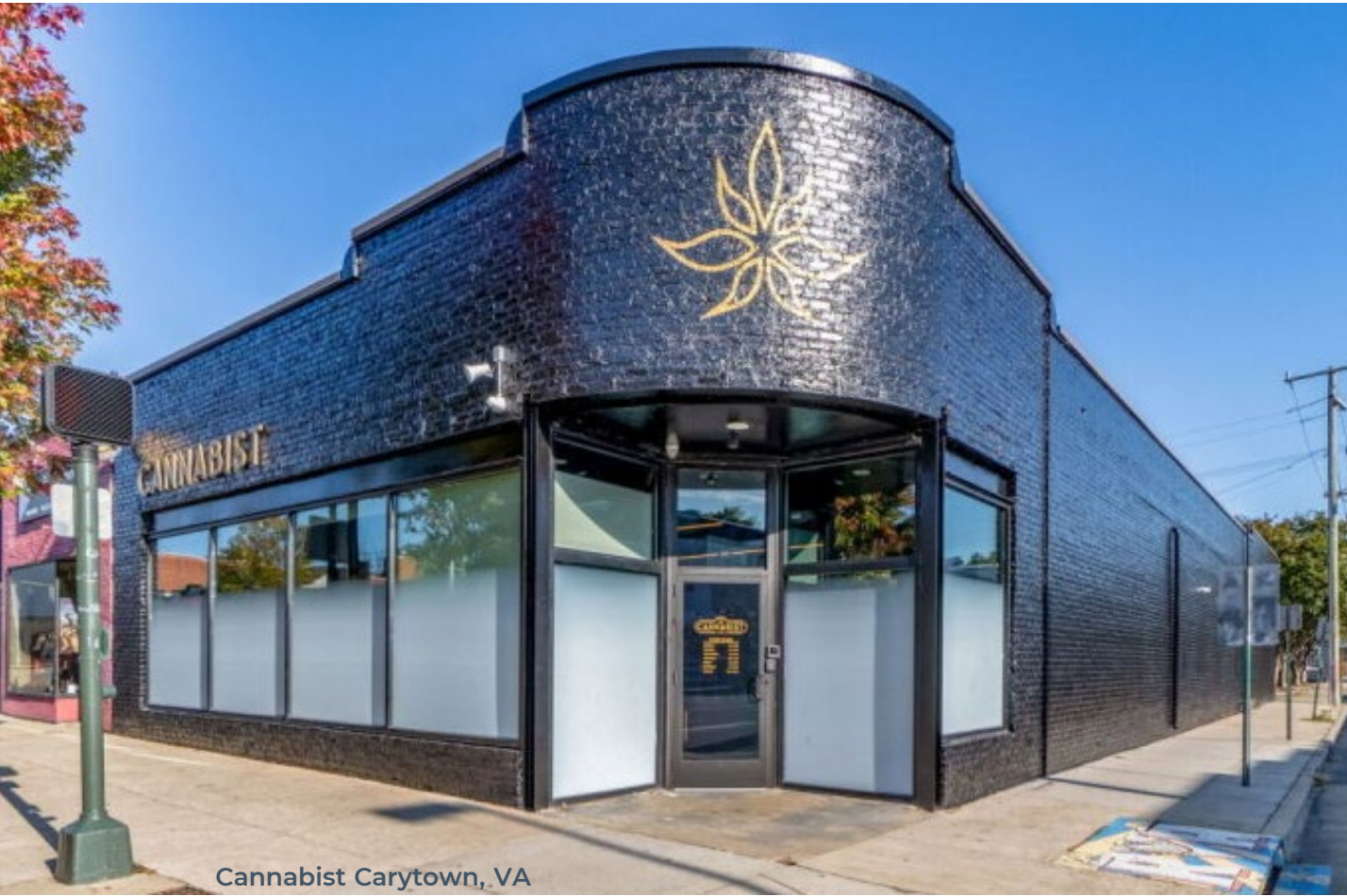
Cannabist Carytown, VA

Maintain liquidity, utilize runway to improve margins and drive cash flow generation